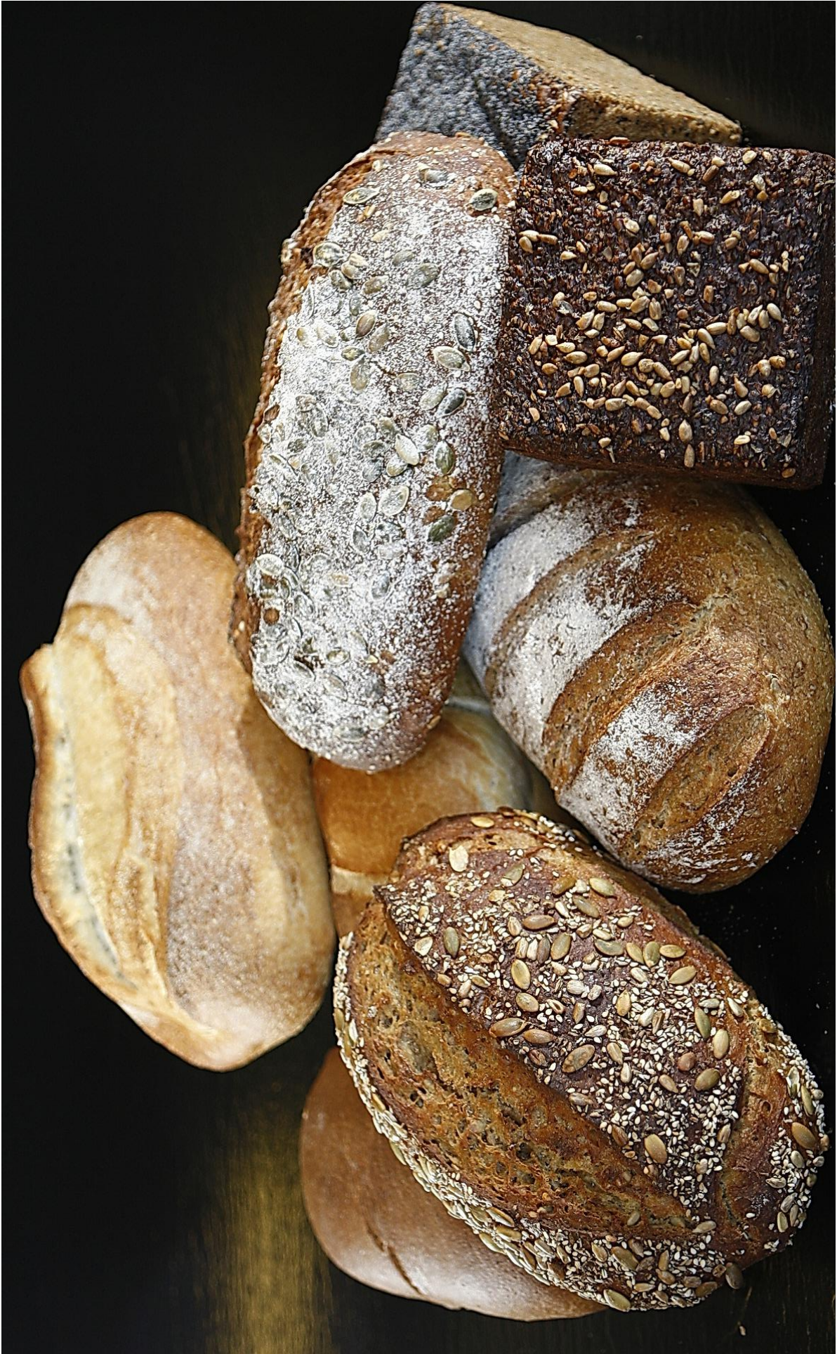
Adapted with permission from CAFOD