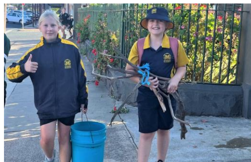
Students carry a bucket of water and a bundle of firewood in solidarity with the millions of people required to walk many kilometres each day to meet their basic needs.