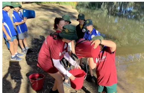
Students fill their buckets at the local river as part of their Walk for Water/ Caritas Ks challenge.