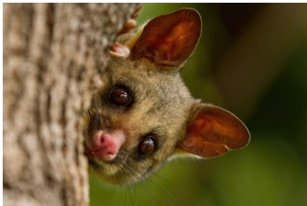
Brushtail Possum by Unknown Author is licensed under CC BY-SA

The earth is getting drier and warmer which is changing the living conditions for Australian plants and animals. Humans clear native bush to make space for us to live or to grow food. This is making it difficult for our Australian animals to find a good place to live where there is food and shelter.