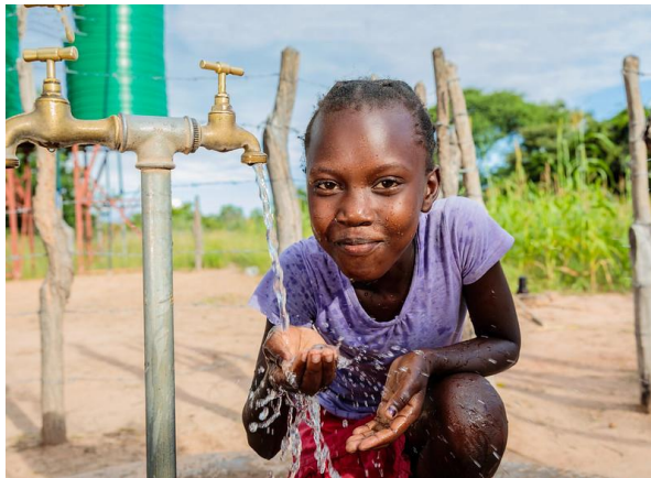
Thandolwayo collecting water in Zimbabwe.