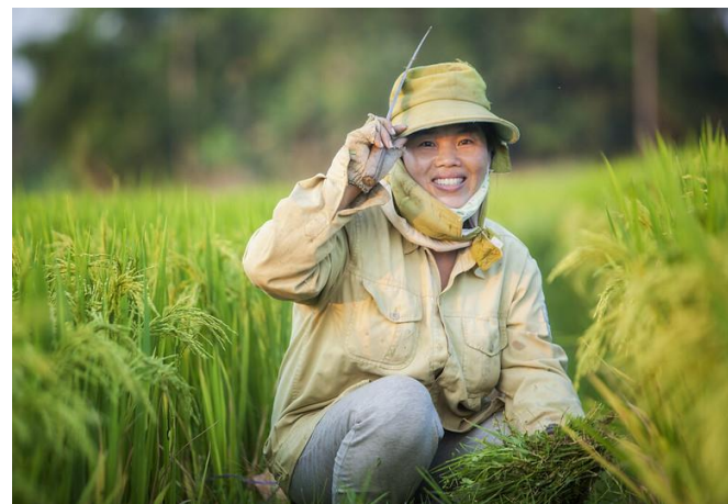
Harvesting rice in Vietnam.

Learn more using the " Introduction to Caritas Australia " PowerPoint.