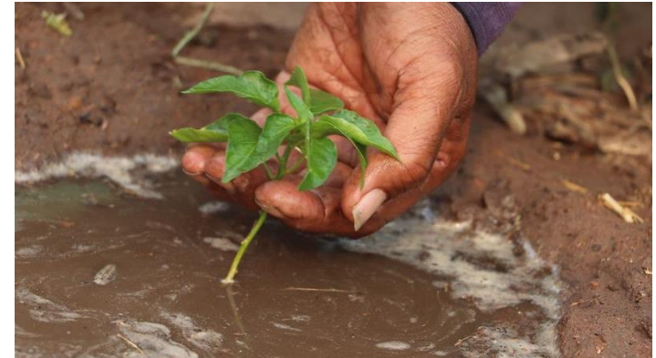
Planting beans in Cambodia.

Soil comes from broken pieces of rocks, so you can imagine how many thousands of years it has taken for our soil to form on earth. Soil is really important because it is the first place our food comes from. Plants absorb nutrients from the soil, then animals and humans eat these plants and/or other animals to obtain their food.