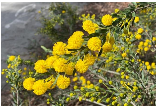
Wattle bloom.

Catholic Earthcare is encouraging all schools and parishes to take action for our common home in answer to the urgent appeal from Pope Francis' encyclical and the Action Platform for Laudato Si'. We are also responding to the call from our Australian Catholic Bishops in the Social Justice Statement 2021-22, "Cry of the Earth, Cry of the Poor".