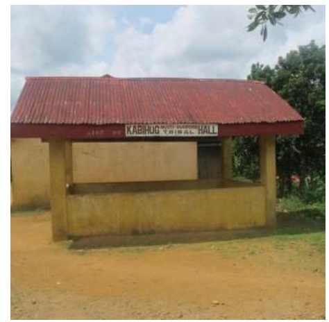
Kabihug mulit-purpose hall

A strengthened sense of self-esteem will enable Kabihugs to integrate into mainstream society while still keeping their indigenous culture.