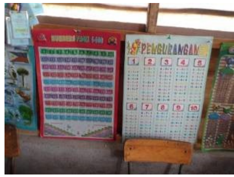
Inside the school classroom