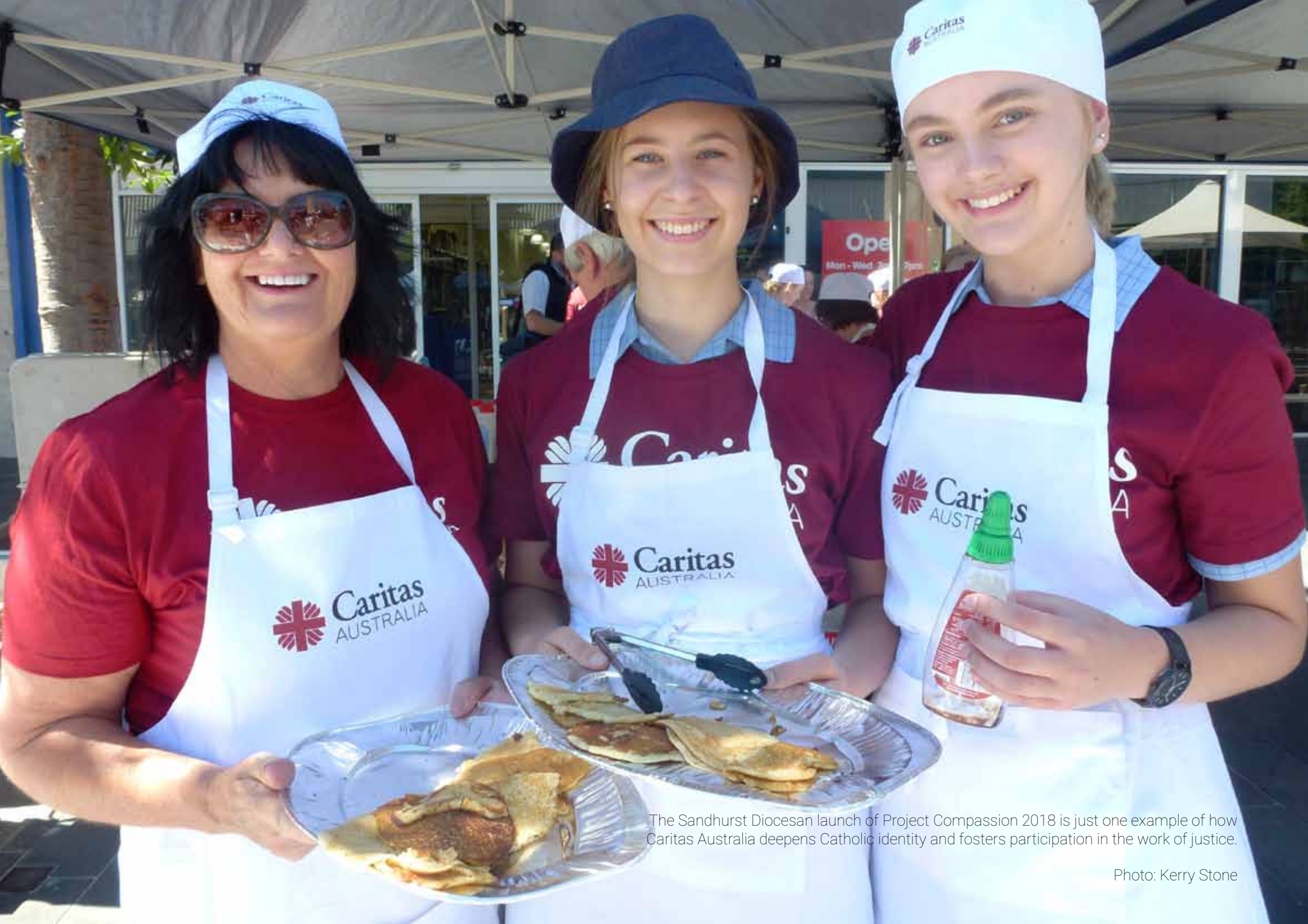
The Sandhurst Diocesan launch of Project Compassion 2018 is just one example of how Caritas Australia deepens Catholic identity and fosters participation in the work of justice.