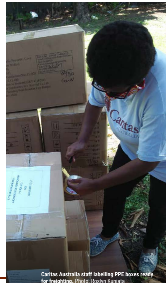
Caritas Australia staff labelling PPE boxes ready for freighting.