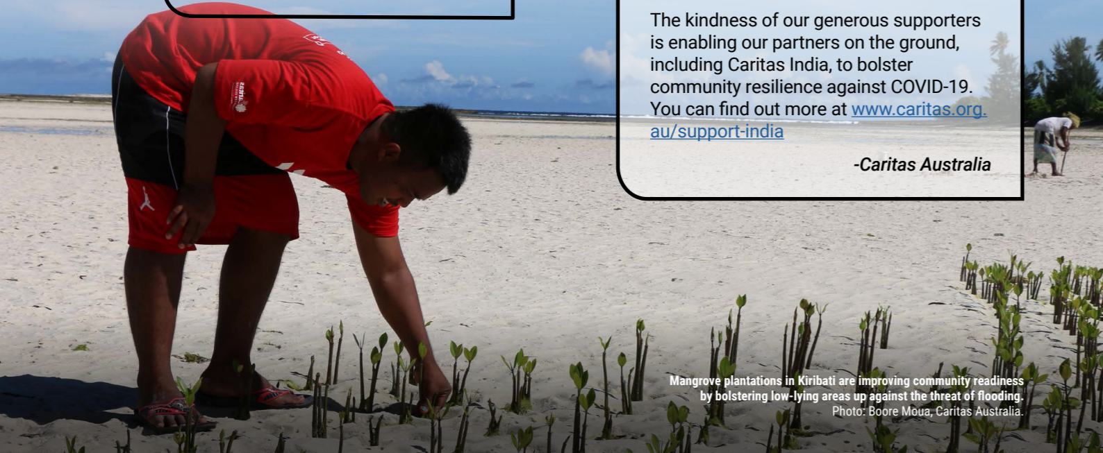
Mangrove plantations in Kiribati are improving community readiness by bolstering low-lying areas up against the threat of flooding.