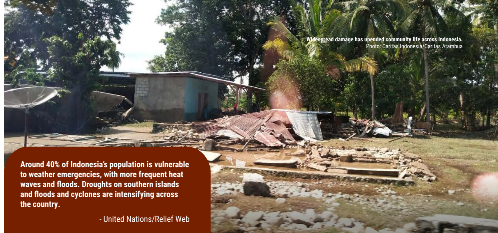
Widespread damage has upended community life across Indonesia.

using terracing and tree planting to prevent erosion and landslides.