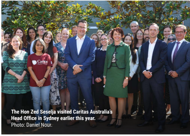
The Hon Zed Seselja visited Caritas Australia's Head Office in Sydney earlier this year.

We were thrilled to have the Minister for International Development and the Pacific, Senator the Hon Zed Seselja, visit our Alexandria office.