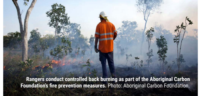
Rangers conduct controlled back burning as part of the Aboriginal Carbon Foundation's fire prevention measures.

Visit www.caritas.org.au/firstaustralians to find out more, today!