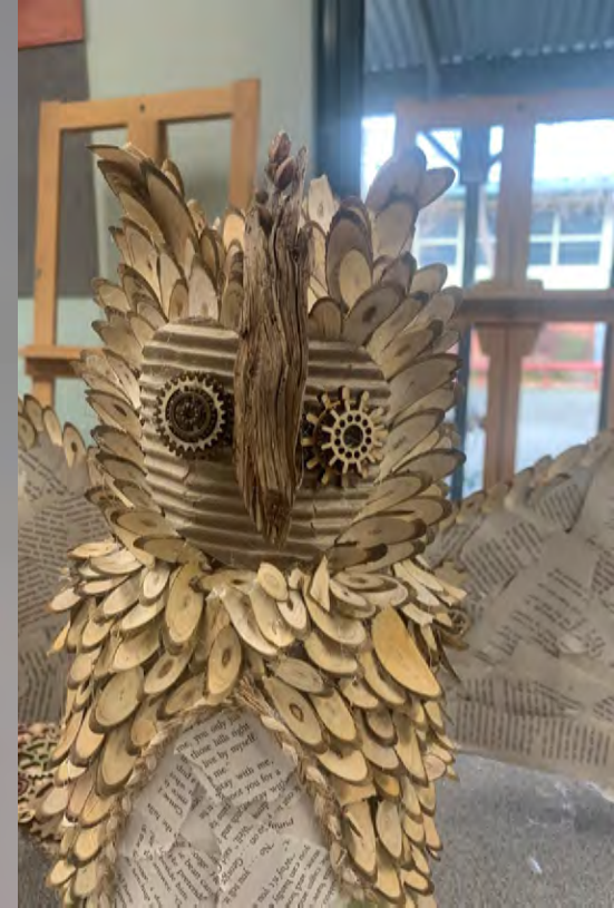
Entry Number 326 Isla St Mary's